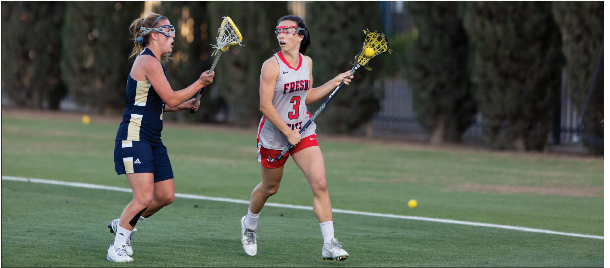
Darlene Wendels • The Collegian